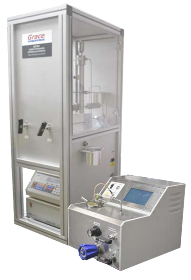
M7355 Volumetric Cement Expansion/Shrinkage Device